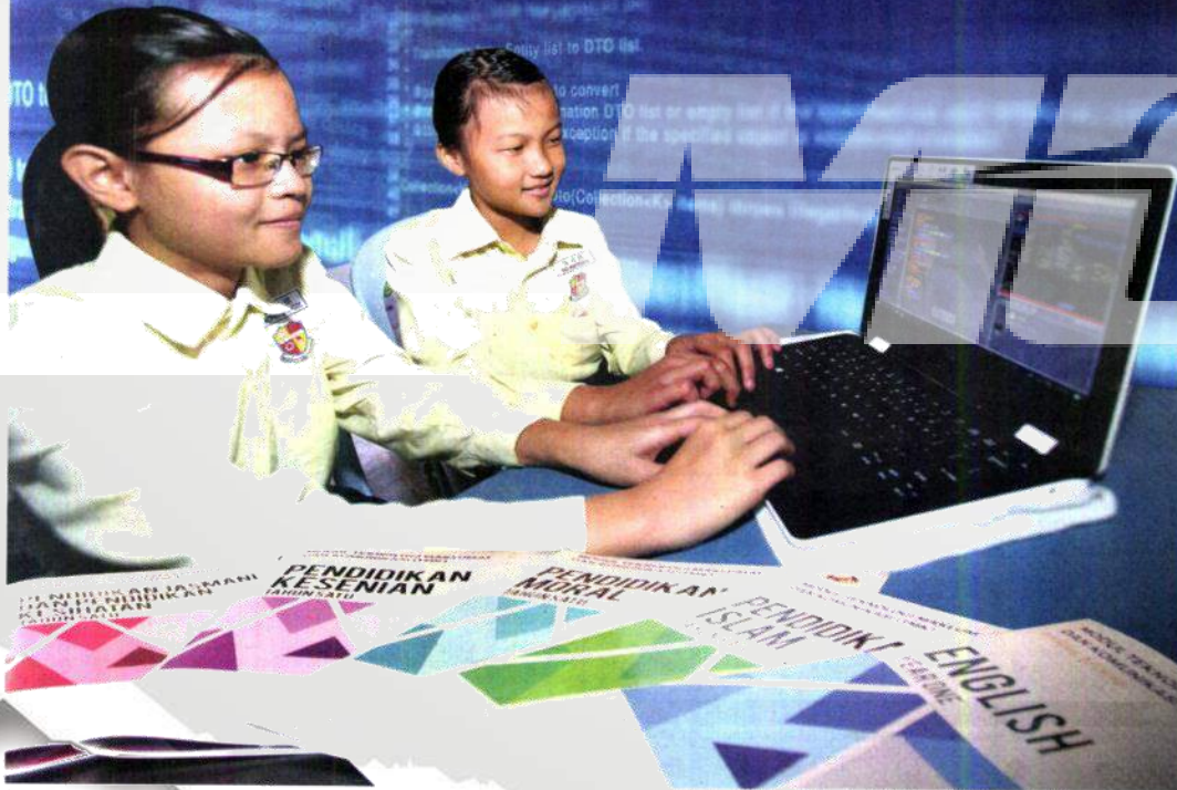
New wave: Students will soon learn computational thinking in school thanks to a government initiative and modules developed with the help of the Malaysia Digital Economy Corporation.

Coding skills will be a huge asset for our schoolchildren when they enter the digital economy workforce. Coding is, after all, the basis for the creation of apps, software and websites. To equip them properly, the Education Ministry has trained 17,000 teachers to be coding-competent and the number is growing. Encouragingly, tests show there is no rural-urban gap or even a gender gap in digital capability among our students. > See Page 6 for reports by ADRIAN CHAN